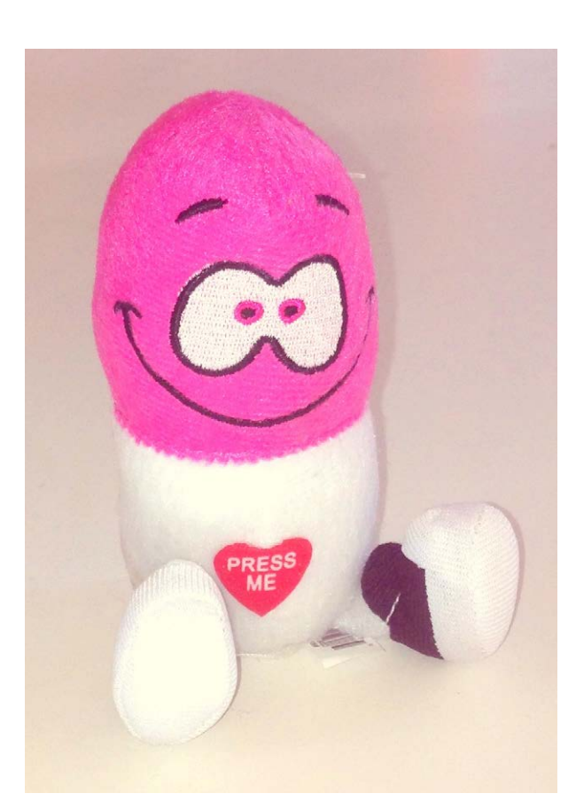
This week's second prize, the Happy Pill: Go ahead and operate heavy machinery. It's all good. (Not to be taken internally.)